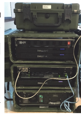
Tactical Server Infrastructure (TSI Version 2(a) - Large