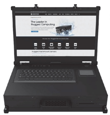
Tactical Server Infrastructure (TSI) Version 2(a) - Small

• In November 2019, the Army conducted a Program Executive Office Command, Control, Communications - Tactical (PEO C3T) Acquisition Decision Memorandum (ADM)-directed, program-led developmental performance test to verify correction of deficiencies noted during the 2018 Command Post Computing