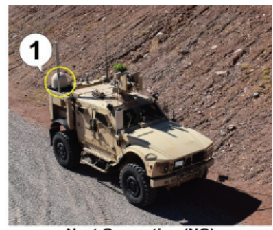
Next Generation (NG) Soldier Network Extension (SNE)