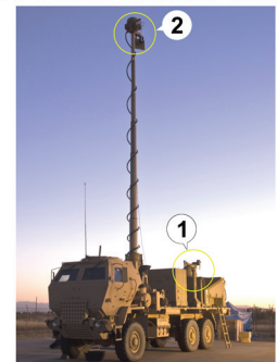
Tactical Comms Node

M-ATV - Mine Resistant Ambush Protected (MRAP) All-Terrain Vehicle (M-ATV)