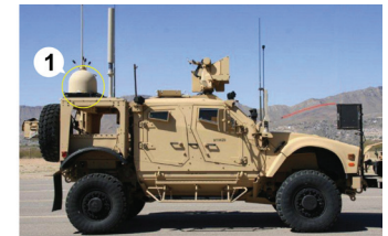
M-ATV Soldier Network Extension