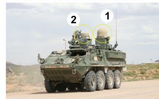
Stryker Point of Presence