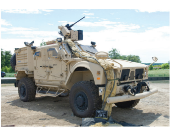
Special Operations Forces M-ATV