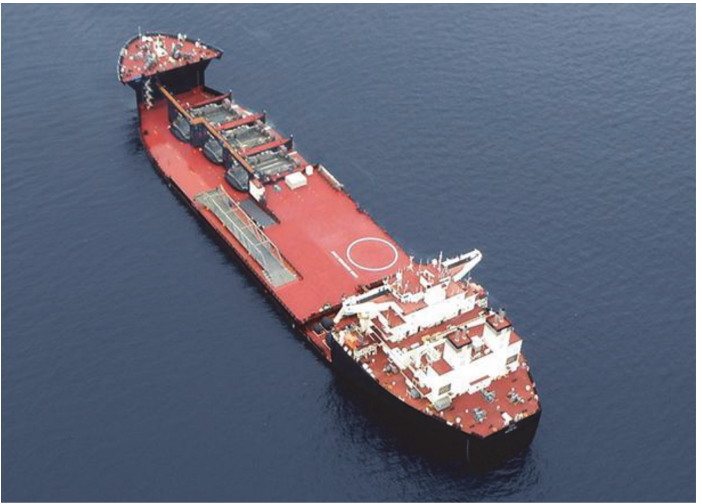
Core Capability Set (CCS)